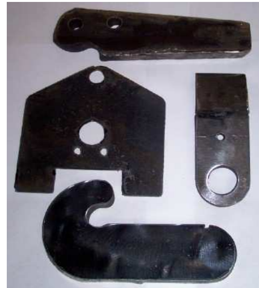
Sample Steel Burnouts

plasma cutting machine can cut steel sheet & plate 5 foot x 10 foot plate thickness up to 3/4"